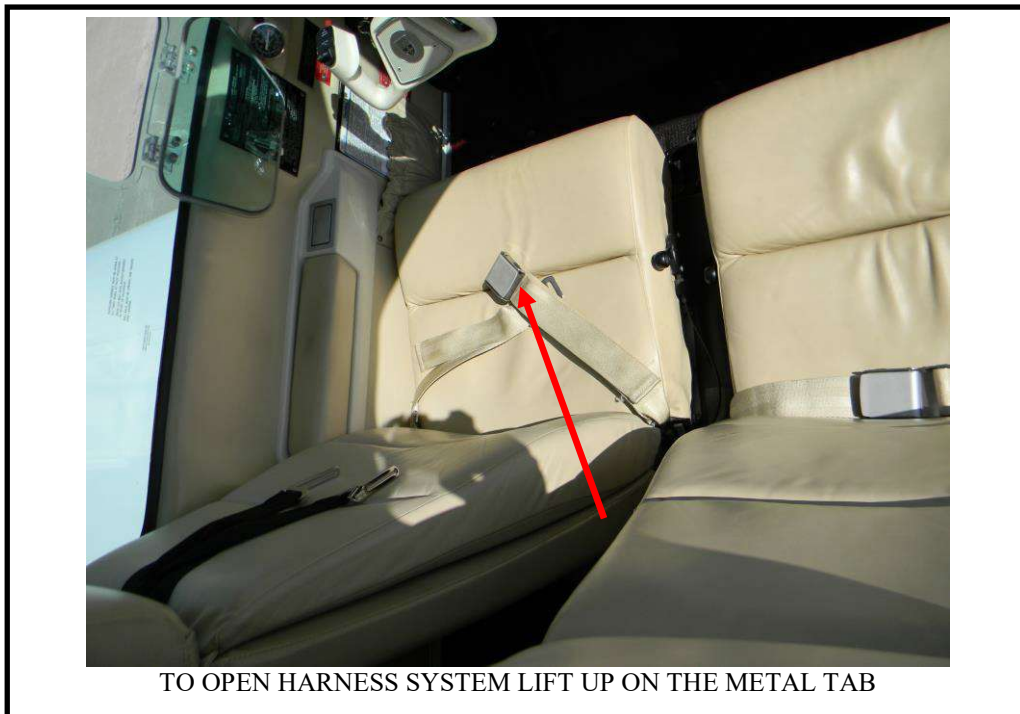
TO OPEN HARNESS SYSTEM LIFT UP ON THE METAL TAB

Aircraft Type: BEEHCRAFT BONANZA F33C Registration: N14JP Pilot Name: JIM PEITZ Date: 7-16-2013