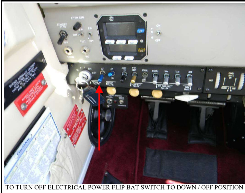
TO TURN OFF ELECTRICAL POWER FLIP BAT SWITCH TO DOWN / OFF POSITION